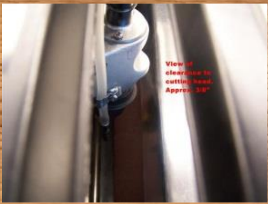
View of clearance to cutting head. Approx. 3/8"